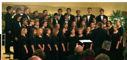
Entertainment - courtesy of