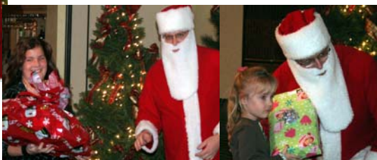
And a special guest appearance from Santa