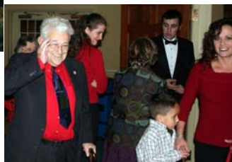
A lot of Happy Faces